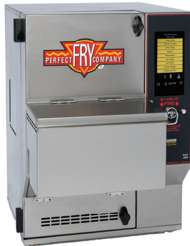
Robotic Loading & Dispensing - Digital Control - Heat Lamp Option Oil 2.75 US Gallons (11L)